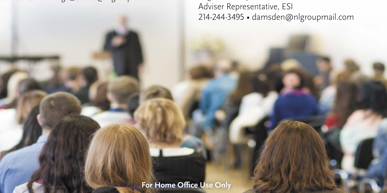
For Home Office Use Only